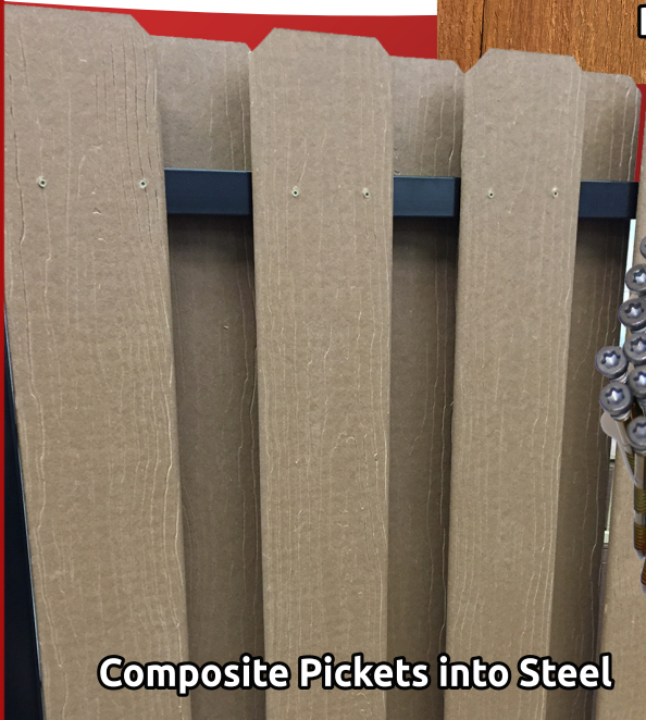
Composite Pickets into Steel