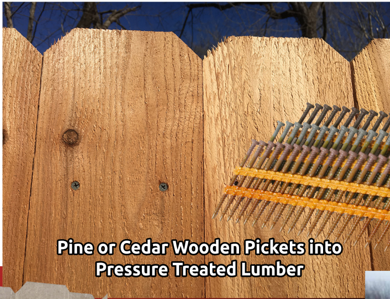
Pine or Cedar Wooden Pickets into Pressure Treated Lumber