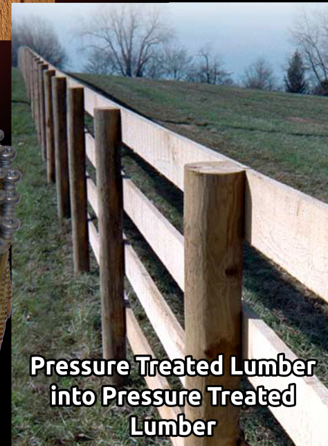
Pressure Treated Lumber into Pressure Treated Lumber