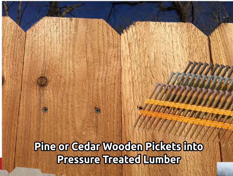
Pine or Cedar Wooden Pickets into Pressure Treated Lumber