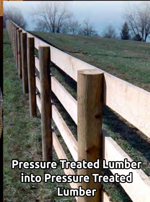
Pressure Treated Lumber into Pressure Treated Lumber