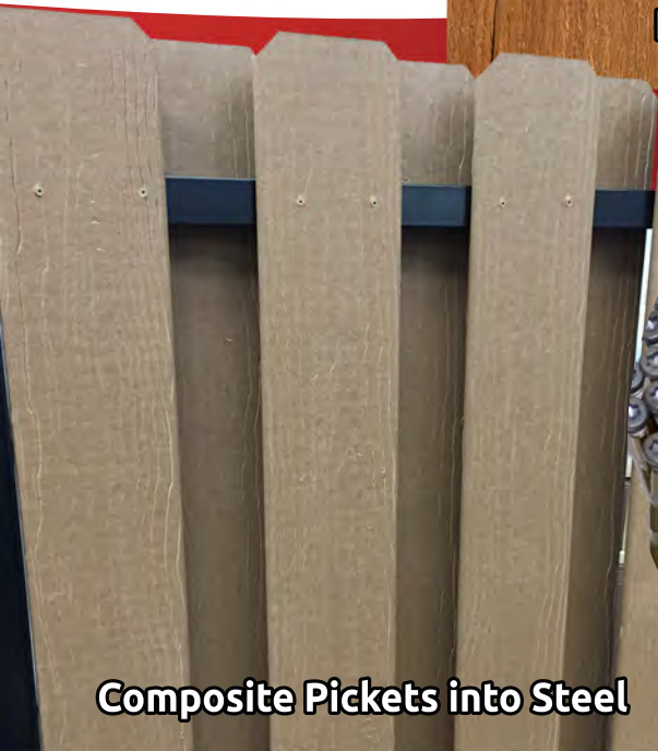
Composite Pickets into Steel